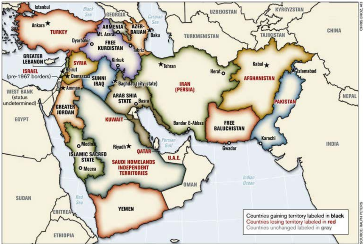
“The New Middle East”: Unofficial US Military Academy Map by Lt. Col. Ralph Peters

According to the founding father of Zionism Theodore Herzl, “the area of the Jewish State stretches: “From the Brook of Egypt to the Euphrates.” According to Rabbi Fischmann, “The Promised Land extends from the River of Egypt up to the Euphrates, it includes parts of Syria and Lebanon.”